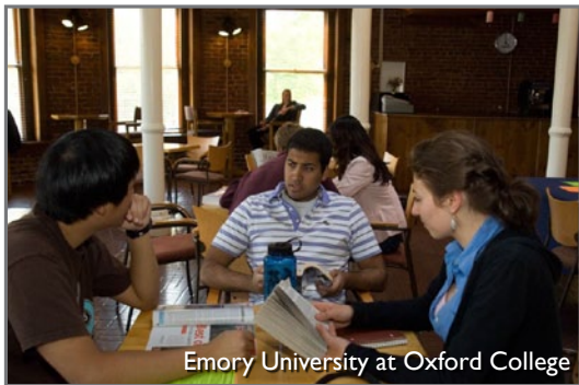
Emory University at Oxford College