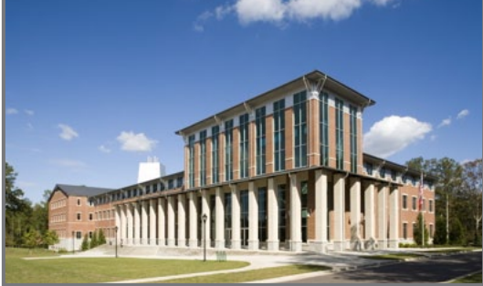
Georgia Perimeter College - Newton Campus